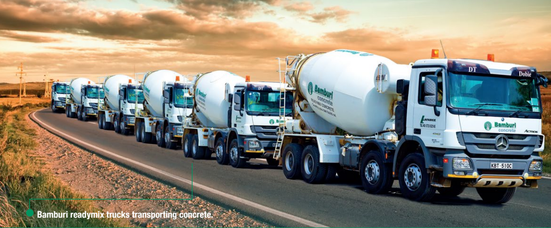
Bamburi readymix trucks transporting concrete.