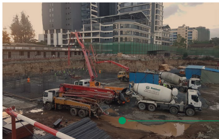
Concrete delivery and pumping in motion. Simultaneous pumping from two Readymix trucks using telescopic boom pumps. 1 boom pump was always on standby.

*The contractor is Zhejiang Chengjian Construction Company (ZJCC)